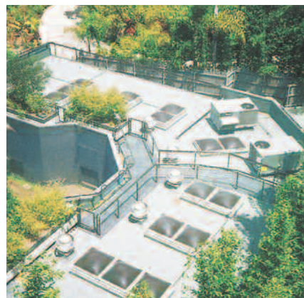
A typical skylight application at The San Diego Zoo.

• Delivery: Fast delivery is a hallmark of Polycast. Stocking locations are strategically located in California, Florida, Illinois, New Jersey and Texas.